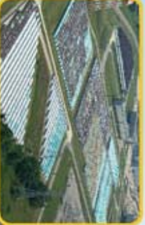
Cylinder Storage Yards