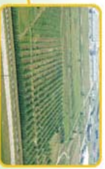
X-749/X-120 Phytoremediation Project