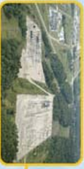
Don Marquis Substation