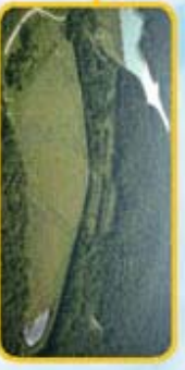
Prairie (Former Sludge Lagoons)