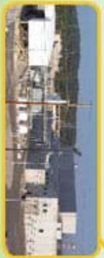
Depleted Uranium Hexafluoride Conversion Facility