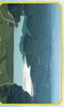
Water Treatment Plant Holding Pond