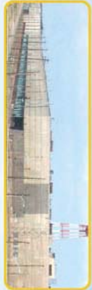
Gaseous Diffusion Process Buildings