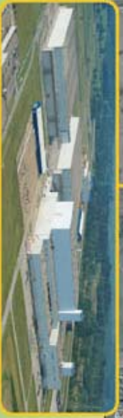
American Centrifuge Plant