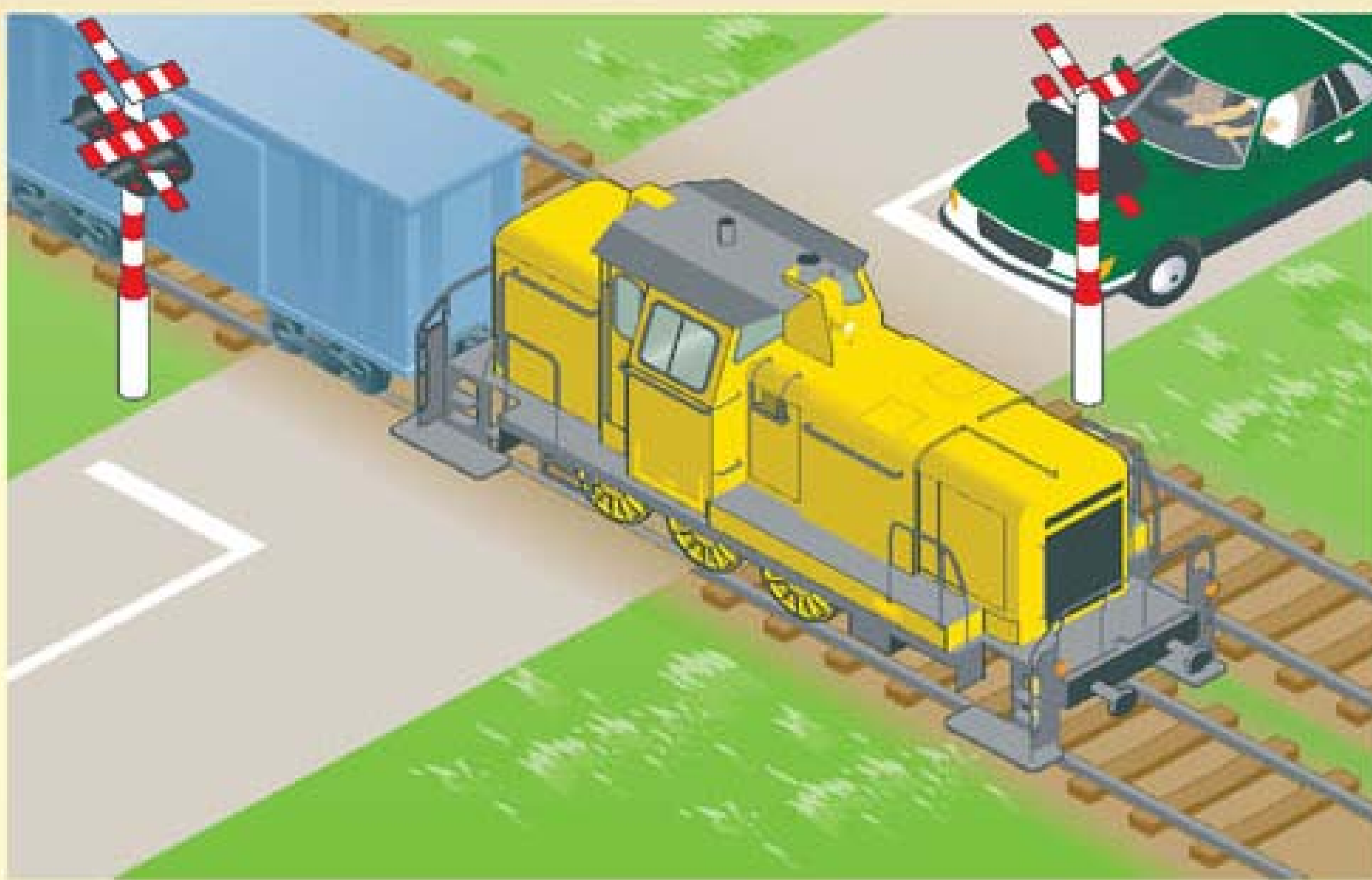
A train with 29,000 railcars traveling at 50 mph would take six hours to pass a RR crossing